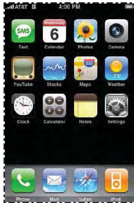
D'305 Patent, Fig. 1.

The three utility patents at issue in this appeal are U.S. Patent Nos. 7,469,381 (“381 patent”), 7,844,915 (“915 patent”), and 7,864,163 (“163 patent”). We discussed the ’381 patent in Apple I . As we explained there: